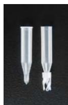
250µL Polypropylene Inserts

Insert precisely sits in the neck of the vial, thus eliminating the need for metal or plastic springs.