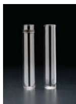
350µL Glass Flat Bottom Insert